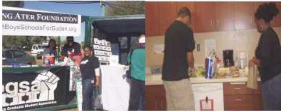
Martin Luther King Service Project