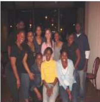
AZ Ballroom, Dance Social

participated in all forms of traditional ballroom dances. Members remarked that they were hesitant at first but by the end of the night they all thought that the activity was fun.