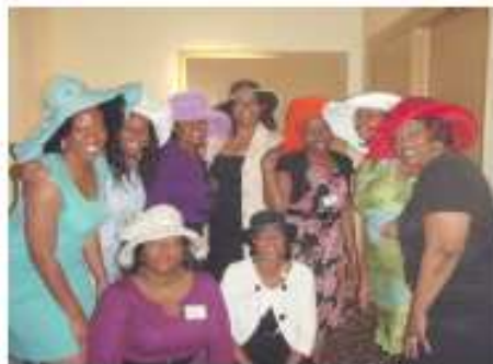
Hat Walk participants.