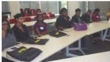
Post Baccalaureate Experience Workshop