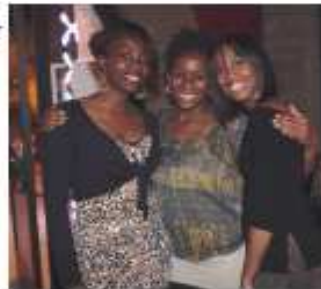
Copyright Potential attendees

In mid-January, we hosted a welcome back dinner/fundraiser at Claim Jumper. Although only a few weeks had passed since the potluck in December, it was good to see black graduate student faces again. We came out with the start of a new semester and $88.68. Next, in order to make a more convenient profit, we had two fundraisers operating at the same time at the end of January. Wendy's and Boston Market were gracious enough to allow us this opportunity, and we were gracious enough to take $101.12 and $293.76 (respectively) off their hands. Rolling right into February, BGSA held the Copyright Potential event at Neo of Malaka, a chic Malaysian restaurant. Attendees were able to drink, mingle, and dance for a $5 cover that went directly to BGSA. We walked out of Neo of Malaka with $417!